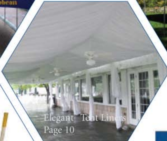
Elegant™ Tent Liners Page 10