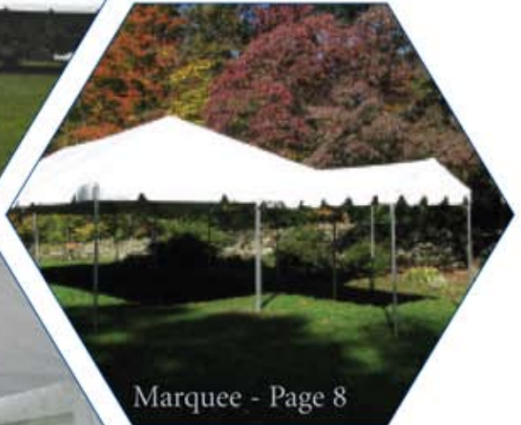
Marquee - Page 8