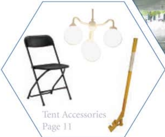
Tent Accessories Page 11