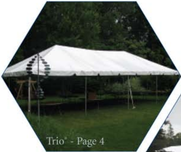
Trio® - Page 4