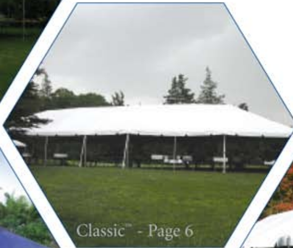
Classic™ - Page 6